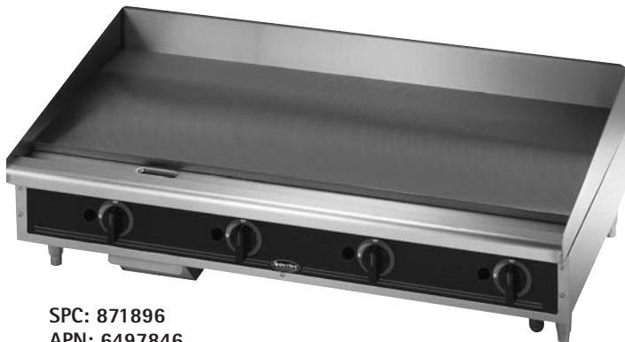
SPC: 871896 APN: 6497846

Specifications subject to change without notice.