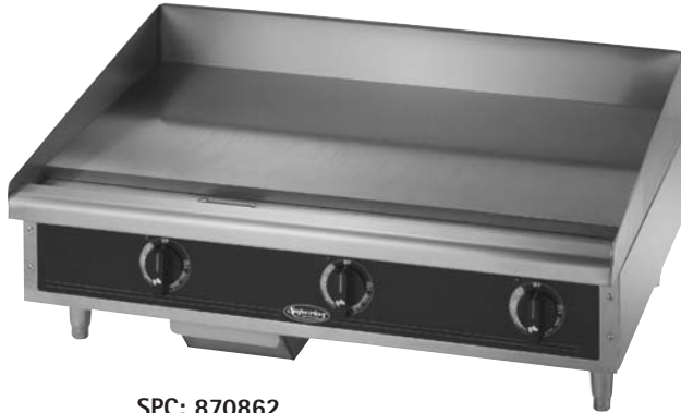
SPC: 870861 APN: 8348559